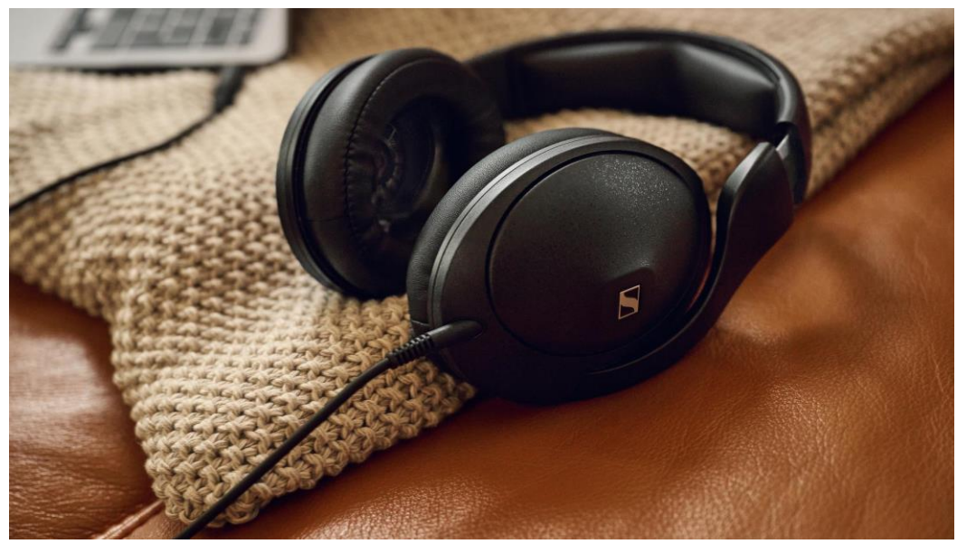
Pictured: The HD 620S is constructed of premium materials for lasting durability and comfort