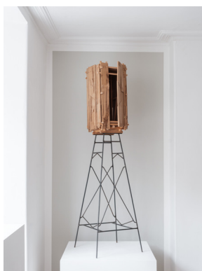
David Gates, 'Threshold III,' 2022