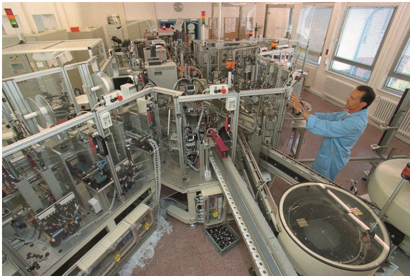
Setup of the initial manufacturing line for evolution microphones