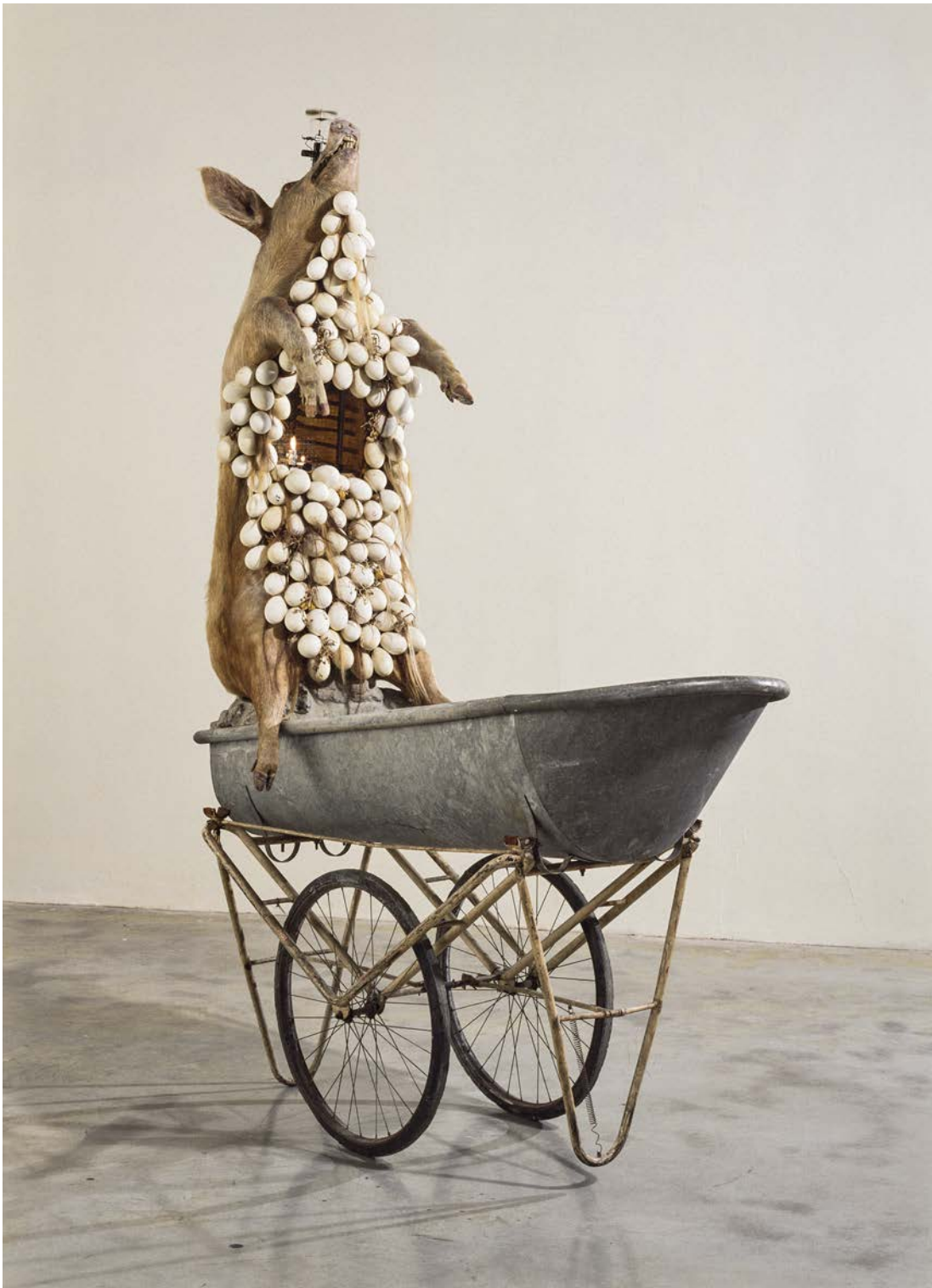
Les Reines mortes, 1988.