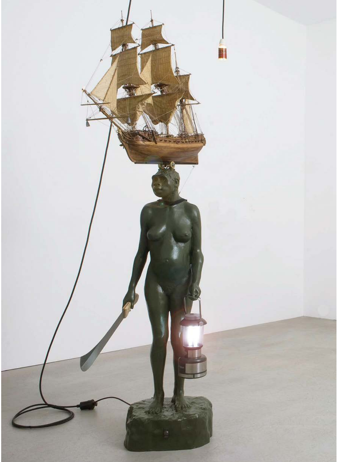
Lucy I Have a Dream, 2008.