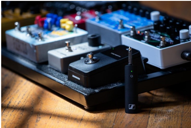
The XSW-D Pedalboard Set features a built-in guitar tuner

The XSW-D Portable Lavalier Set includes a transmitter (mini-jack) with belt clip, receiver (mini-jack) with camera connection cable and shoe mount and an ME 2-II lavalier mic.