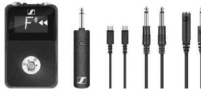
For guitarists and bassists: the XSW-D Pedalboard Set