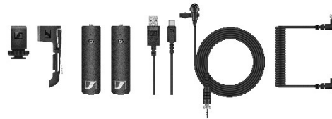
For videographers and content creators: the XSW-D Portable Lavalier Set

The XSW-D Vocal Set includes a transmitter (XLR-3) and receiver (XLR-3, e.g. for mixing desks), an XS 1 microphone (cardioid pick-up pattern), mic clip and USB charging cable.