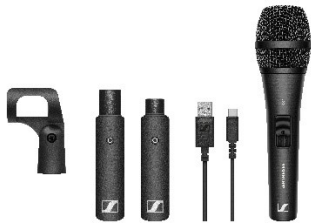
For singers and presenters: the XSW-D Vocal Set