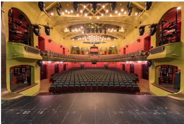
The Munich Kammerspiele theatre is stylistically influenced by Art Nouveau

The Munich Kammerspiele theatre company boasts an exclusive location right in the heart of the Bavarian state capital. The architectural style of the theatre, which was completed in 1901, is visibly influenced by Art Nouveau and characterised by the colours and shapes of the early 20 th century.