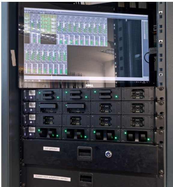
The Wireless Systems Manager (display screen) and the L 6000 rack charging station

Battery capacity, performance, reliability and environmental protection all go hand in hand: “This is the first time I’ve been able to use batteries in live performances with a clear conscience and without having to worry about them,” said Wolfram Schild, commenting on the innovative charging technology of the Sennheiser Digital 6000 series. “In the past, we mainly used non-rechargeables that were certainly not the ideal solution from an environmental perspective – we had to dispose of heaps of used batteries every month.”