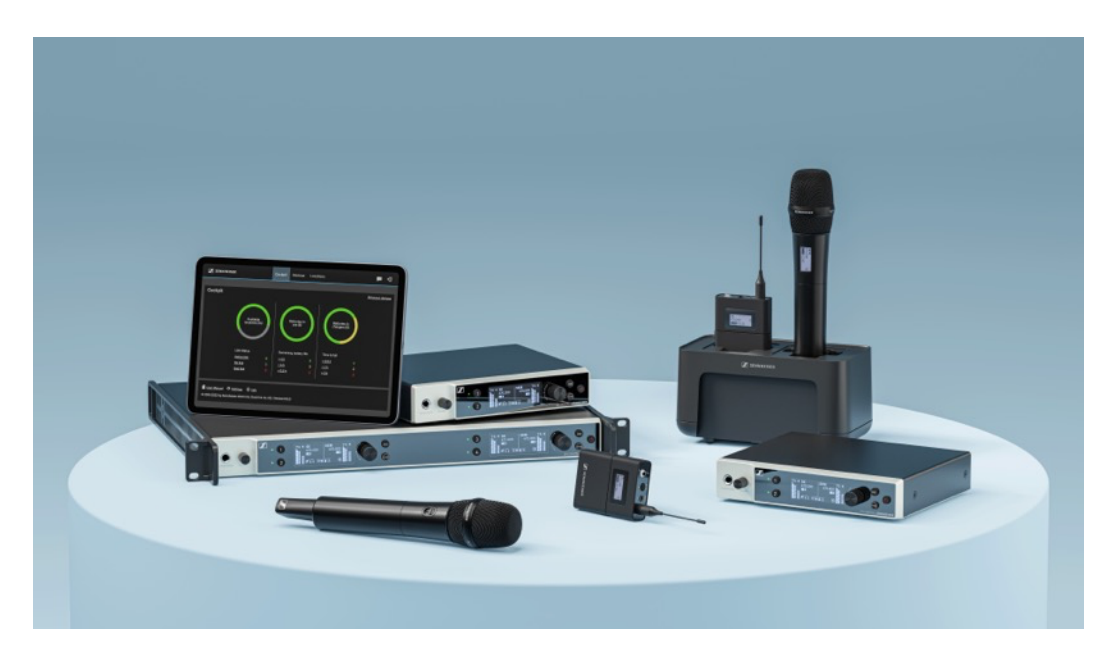
As the technological successor to evolution wireless G4, EW-DX is designed for the most demanding business and professional applications

For the first time at ISE, the latest member of the Evolution Wireless Digital family will be on display. Designed to make collaboration and learning easier, EW-DX is powerful and flexible enough for even the most demanding business and professional applications. With its straightforward installation and integration, the system easily scales across your existing Dante network, from the smallest meeting room or classroom to the largest educational and corporate campus installations. EW-DX and its components will be featured on a product table for visitors to experience firsthand.