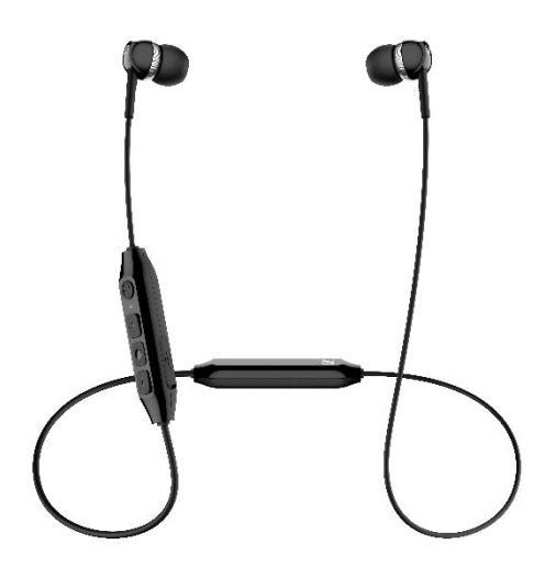
The CX 350BT features a dedicated voice assistant button for immediate, at-a-touch interaction with Siri or Google Assistant.

The earphones' intuitive remotes make it easy to control music and phone calls. The CX 350BT additionally features a dedicated voice assistant button for immediate, at-a-touch interaction with Siri or Google Assistant, as well as additional smart features. Via the intuitive equalizer on the Sennheiser Smart Control app, users can customize their sound experience to their exact preference. The app also offers firmware updates and a podcast mode for enhancing speech content.