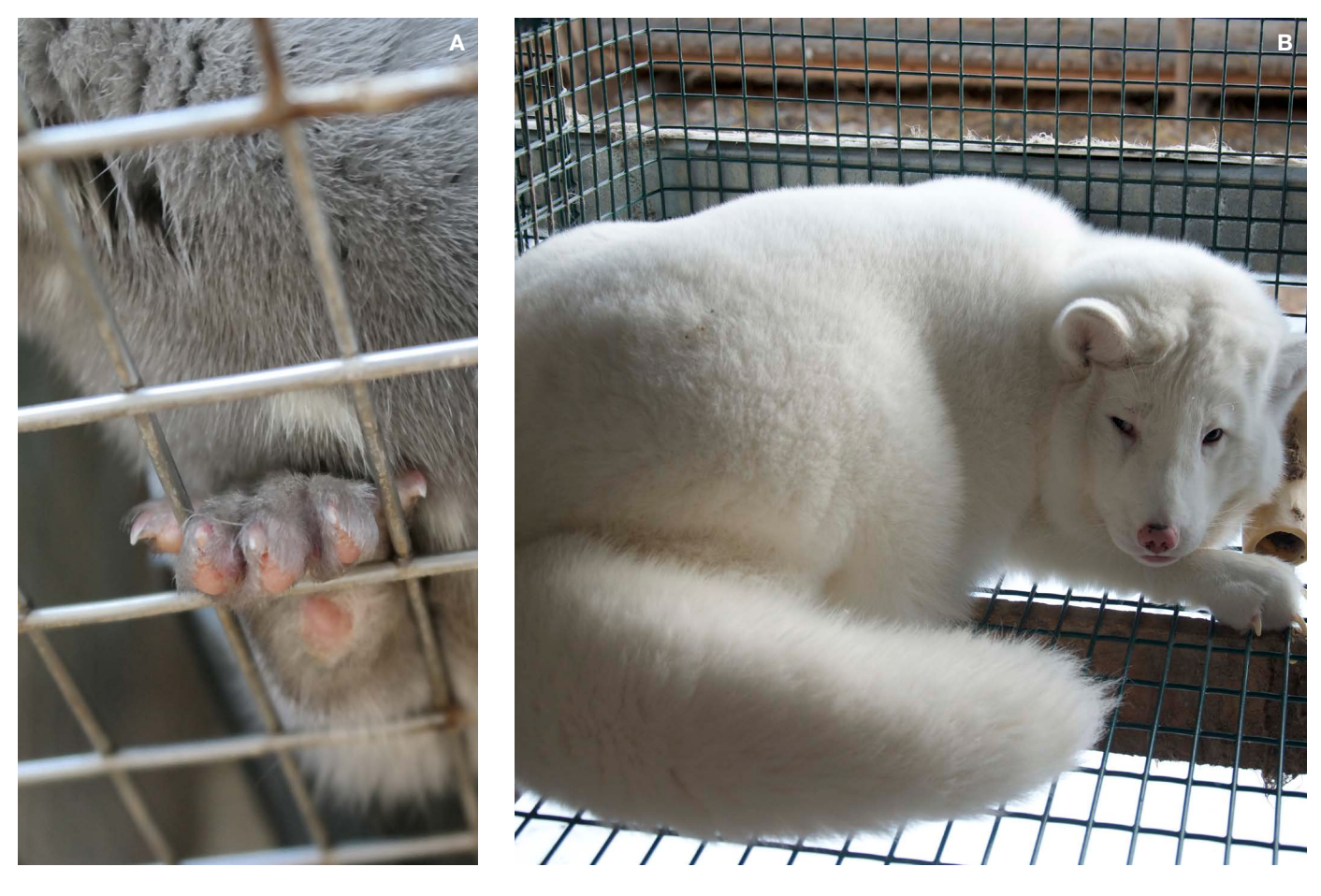
Fur animals live on wire mesh their entire life (mink on Norwegian farm). Blue foxes are frequently severely overweight, which makes it even more uncomfortable to move in the wire mesh cage (fox on Finnish farm).

ailments due to breeding; examples being infanticide, dental problems, gastric ulcers, deafness and blindness. Additional health concerns have come to light through a Norwegian governmental report in 2014; namely increased group housing of minks leading to more aggression and wounds and the overfeeding and weight problems of blue foxes following desired increase in skin size.<sup>173</sup>