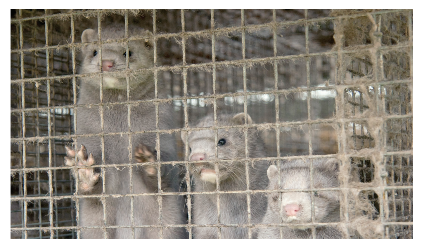
Minks on Norwegian farm: Fur farming accounts for only 1 % of agricultural income in Norway.

When animal welfare regulations were tightened the Finnish government granted subsidies to farmers to renovate their farms and cages to comply with the new legislation. Farmers were given a ten-year transitional period but in the end the Finnish state funded 22 % of these investments.<sup>367</sup>