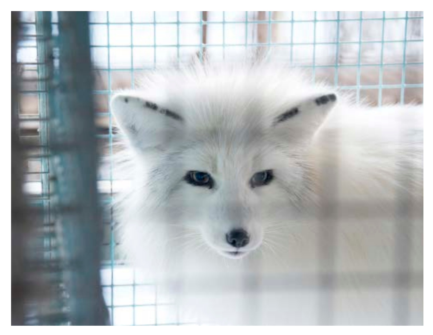
Fox in cage at Finnish fur farm.