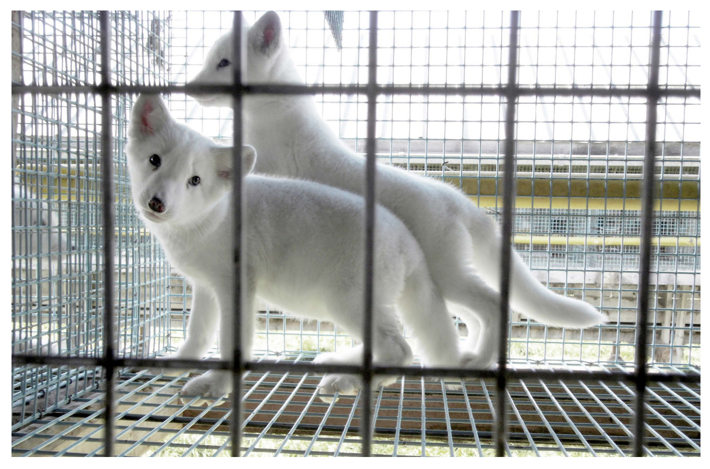
Foxes on Finnish farm: The regulations allow to weaned fox cubs to live on 1.2 m<sup>2</sup> on both Finnish and Norwegian farms<sup>VIII</sup> The opportunities for natural behavior, movement, and play are highly restricted for these cubs.