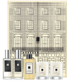
House of Jo Malone London