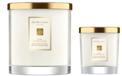
Pine & Eucalyptus Luxury/ Home Candle