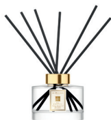
Pine & Eucalyptus Diffuser