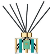
English Pear & Freesia Diffuser