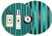
Pomegranate Noir Collection