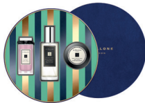
Scented Bedtime Collection