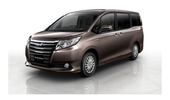
Noah Concept (hybrid vehicle)