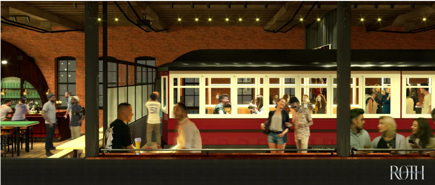
A rendering from Roth Sheppard Architects shows what the streetcar will look like in its new location.

The original arch that graced the exterior of the building until the mid-70s is prominent in the newly updated space as the centerpiece of the meticulously restored bar.