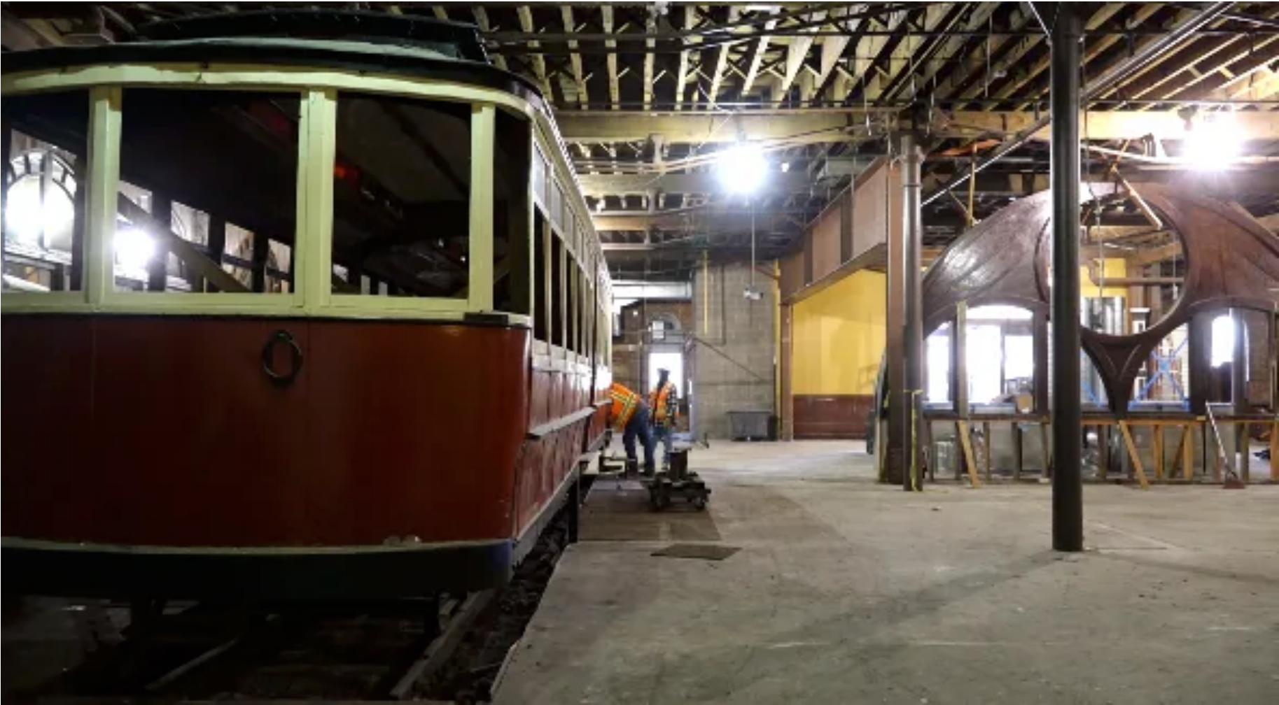
Crews prep the streetcar for a tricky, complicated move from one side of the space to the other.

Urban Putt Denver is taking over the ground floor space of The Denver City Cable Railway Building, the former location of the downtown Old Spaghetti Factory. The building is undergoing extensive renovations and will open in mid-summer.