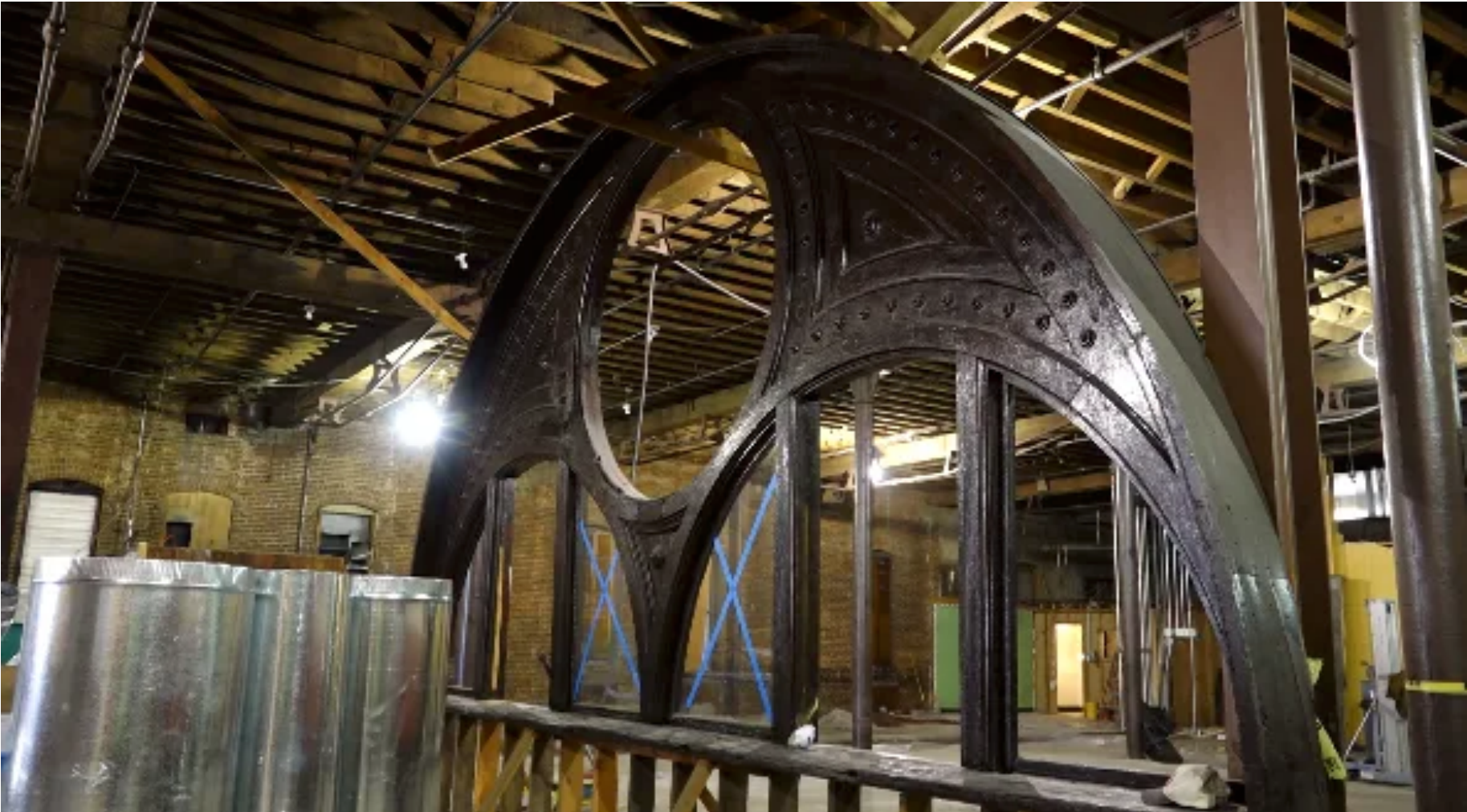
The original metal arch that graced the exterior of the Denver City Cable Railway Building waits to be moved to its new location behind the bar.

The original arch that graced the exterior of the building until the mid-70s is prominent in the newly updated space as the centerpiece of the meticulously restored bar.