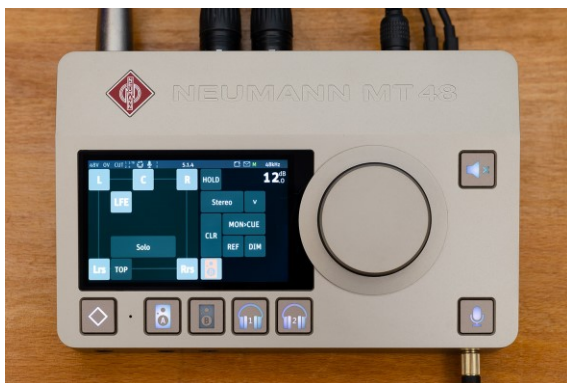
The Neumann MT 48 audio interface will receive a feature update, which will allow working in immersive audio formats

An insulated “Whisper Room” will accommodate selected Neumann microphones for demo. Moreover, Neumann will announce three new products. The MT 48 audio interface will receive an eagerly anticipated feature update, which, among other things, will allow working in immersive audio formats. Another focus is live sound: Neumann will show an omni capsule for the Miniature Clip Microphone (MCM) system as well as goosenecks of various lengths. Also on display will be much-requested additions to Neumann’s renowned family of vocalist capsule heads for wireless systems.