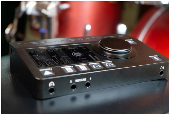
Merging Technologies will showcase its Venue Mission software and its personal mix for musicians

The second immersive workstation will showcase Merging Technologies audio interfaces. A highlight will be the company's Venue Mission software for the Anubis audio interface, which is set to revolutionize workflows for live musicians and sound engineers, providing them with unprecedented control over the entire audio ecosystem via an intuitive user interface that has a full 16-channel mixer at its heart.