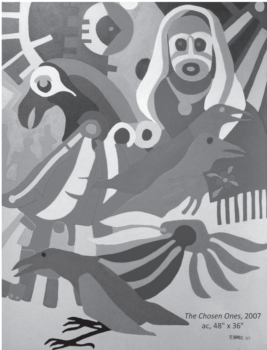
The Chosen Ones, 2007 ac, 48" x 36"