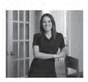
NEWPORT REALTY CHRISTIE'S INTERNATIONAL REAL ESTATE

Providing a complimentary marketing package. So your home will be presented at its finest. Staging, Photography, HD Video Tours, Floor Plans, Brochures, Print & Web Marketing. Please visit MelinaBoucher.ca to find out more.