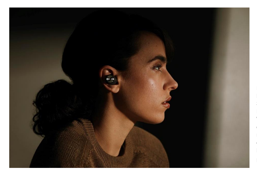
Noise cancelling headphones like Sennheiser's MOMENTUM True Wireless 2 can enhance your meditation experience with beautiful sound or peaceful quiet.