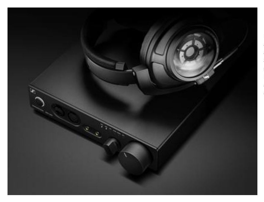
In honour of the audio specialist's 75<sup>th</sup> anniversary, Sennheiser offers a special bundle of the HD 820 headphones and the HDV 820 amplifier.

So, put on your headphones or turn up your speaker, choose a playlist to suit your mood and let the music carry you away. For those seeking an audio escape like no other, Sennheiser's <u>HD</u> 820 audiophile headphones (MSRP: 1,999 GBP) are a true game-changer. The closed-back dynamic stereo headphones feature a unique glass transducer cover that minimises resonances – an innovation that ensures an incredibly realistic and natural sound field. For the ultimate acoustic experience, pair them with the <u>HDV 820 digital amplifier for dynamic headphones</u> (MSRP: 2,099.99 GBP). In honour of the audio specialist's 75<sup>th</sup> anniversary, Sennheiser currently offers a <u>special bundle of this legendary combination at 25% off for 2.998 GBP</u>.