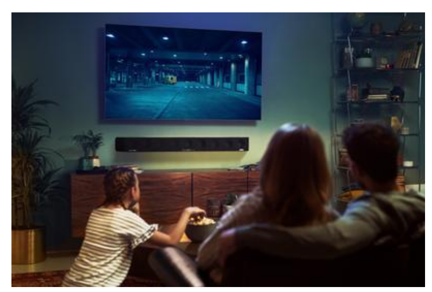
Sennheiser's AMBEO Soundbar is designed to create an immersive 3D sound experience with just one device and transforms the living room into your very own cinema.

A perfect match for the serious movie marathon is Sennheiser's <u>AMBEO Soundbar</u> (MSRP: 2,199 GBP). It is designed to create an immersive 3D sound experience with just one device and transforms the living room into your very own cinema.