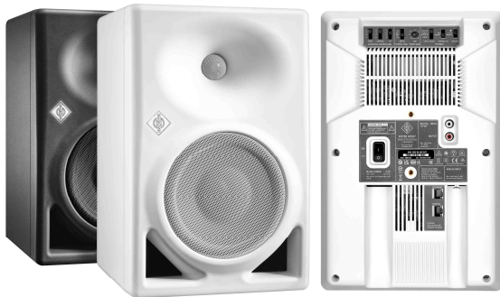
The Neumann KH 150 with AES67 option

Powered by a 5.1.4 AES67-based Neumann monitor set-up with the new KH 150 and two KH 750 DSP subwoofers, the live demo section of the booth will present virtual mixing sessions by immersive audio expert Dear Reality. Visitors will be able to follow an intuitive immersive mixing process using Dear Reality's dearVR SPATIAL CONNECT VR controller and the dearVR PRO spatializer.