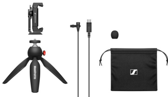
Figure 3 Sennheiser XS Lav USB-C Mobile Kit

(2) LAVALIER microphones with an omni-directional pattern are excellent for sit-down interviews. They are clipped to an interviewee's lapel 6-8 inches from their mouth and can be placed on a desk between two interviewees.