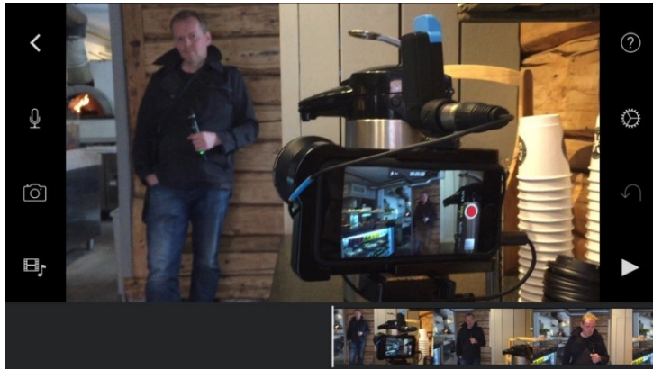
Figure 4 Norwegian journalist recording a stand-up using an iPhone and Sennheiser AVX Combo Set wireless system

(3) WIRELESS MICROPHONES are used to record audio where the source is some distance from the smartphone, like on talent moving in a demonstration, on a boat or a walk-and-talk interview.