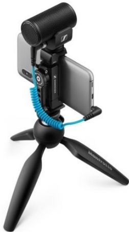
Figure 8 Less obtrusive Sennheiser MKE 200 Mobile Kit using Manfrotto PIXI Tripod