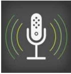
Figure 14 Ferrite app