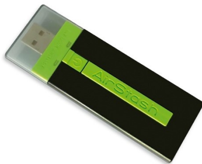
Figure 18 Airstash

Smartphones get clogged with media and we often delete valuable content to free up space. Don't delete your media — you might need it to update your story, or to sell. I use transfer devices to shift and store media and clean out my smartphone. A Lightning version for iOS devices is iXpand by Sandisk; Airstash by Maxell is a WiFi version that works across platforms.