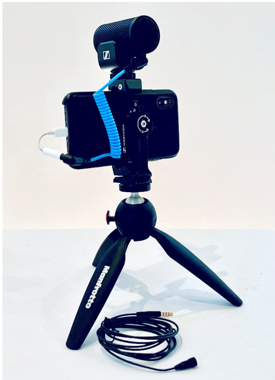
Figure 10 Basic Kit With iPhone XS, MKE 200 Mobile Kit (includes Manfrotto PIXI and Smartphone Clamp), XS Lav Mobile clip-on mic, and TRRS to Lightning adaptor

You can make up your mojo kits depending on your need and the amount of money you wish to spend. Here are examples of a basic, intermediate and advanced mojo kit. You can of course mix and match the level of equipment and brands, depending on your requirements and price points.