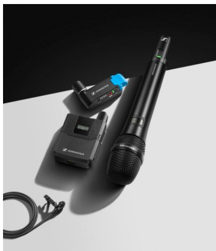
Figure 5 Sennheiser AVX Combo Set

http://smartmojo.com/2015/09/17/sennheiser-avx-combo-first-look/