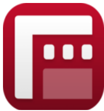
Figure 13 Filmic Pro app