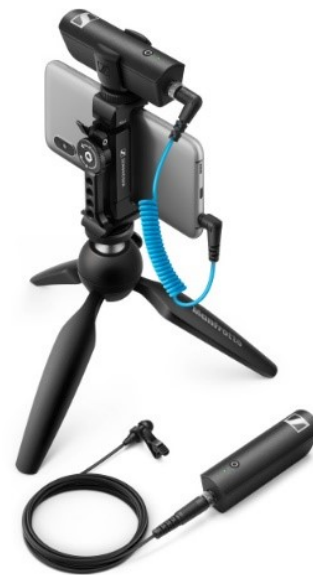
Figure 7 Sennheiser XSW-D Portable Lav Mobile Kit with optimised 3.5mm TRRS cable

Ivo's tip: Sit your subject back to the wind to shield the lapel microphone that's attached about 8 inches below the subject's mouth. Or, if using a shotgun-type microphone, put the mobile journalist's back to the wind when recording an interview. They shield the microphone and any wind that gets past will hit the back of the microphone.