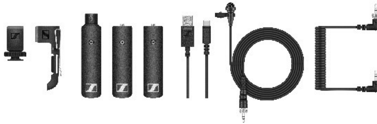
Figure 6 Sennheiser XSW-D ENG Set

The Sennheiser XSW-D ENG Set ($470USD) is a small digital kit in the 2.4GHz band, that includes plug-on transmitters for any dynamic mic and the included ME2-II omni-directional lapel condenser mic. Rechargeable batteries with 5 hours run time. Link up to five systems. I have tested it effectively to beyond the 75m range that Sennheiser recommends.