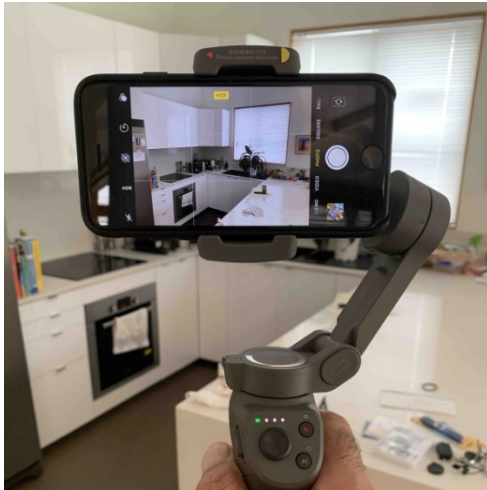
Figure 9 Osmo Mobile 3 gimbal