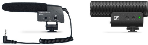
Figure 2 Previous Sennheiser MKE 400 and the new version

pattern, it records in front and behind the capsule. Optimised for speech, it has attenuation and runs for an incredible 100 hrs on two AAA battery. I have been using the earlier version for about 6 years.