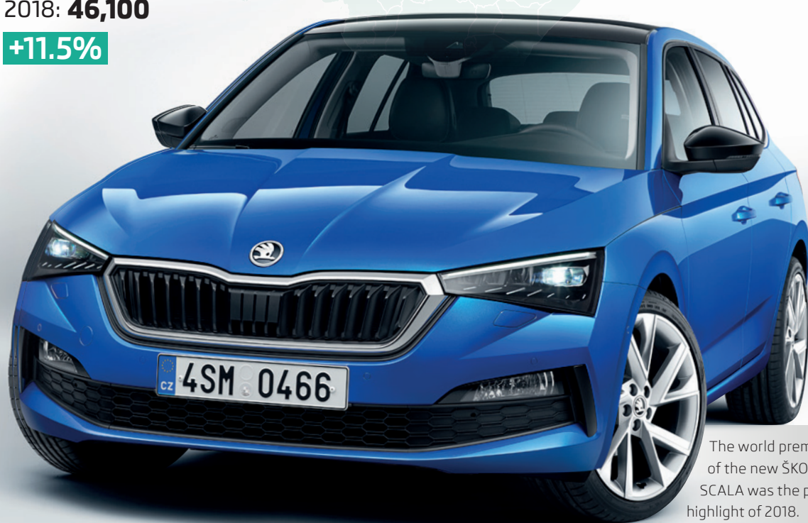
The world premiere of the new ŠKODA SCALA was the product highlight of 2018.