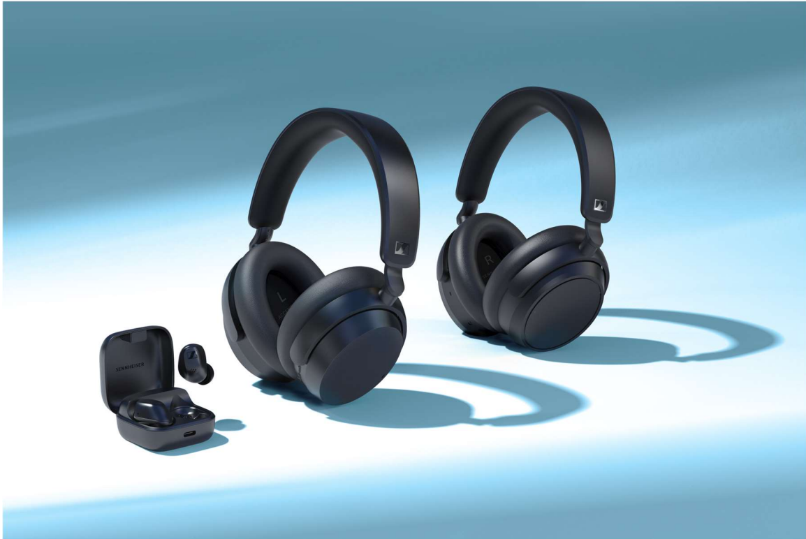
Pictured: The complete family (left to right); ACCENTUM True Wireless, ACCENTUM Wireless, and ACCENTUM Plus Wireless