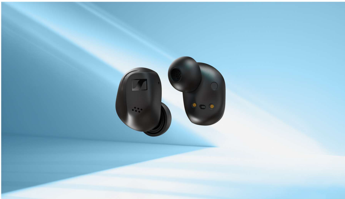
Pictured: ACCENTUM True Wireless is available in black (pictured) and white

From the first listen, ACCENTUM True Wireless is a serious performer. It all starts with the brand's proprietary 7mm dynamic True Response Transducers that reproduce powerful and engaging bass, natural mids and crisp treble—handling even the most complex modern music without breaking a sweat. The ultra-low distortion drivers are made at the Sennheiser Tullamore factory, under the same roof as those found in other ACCENTUM, MOMENTUM and audiophile headphones.