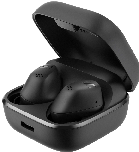
Pictured: ACCENTUM True Wireless in its compact Qi-enabled charging case