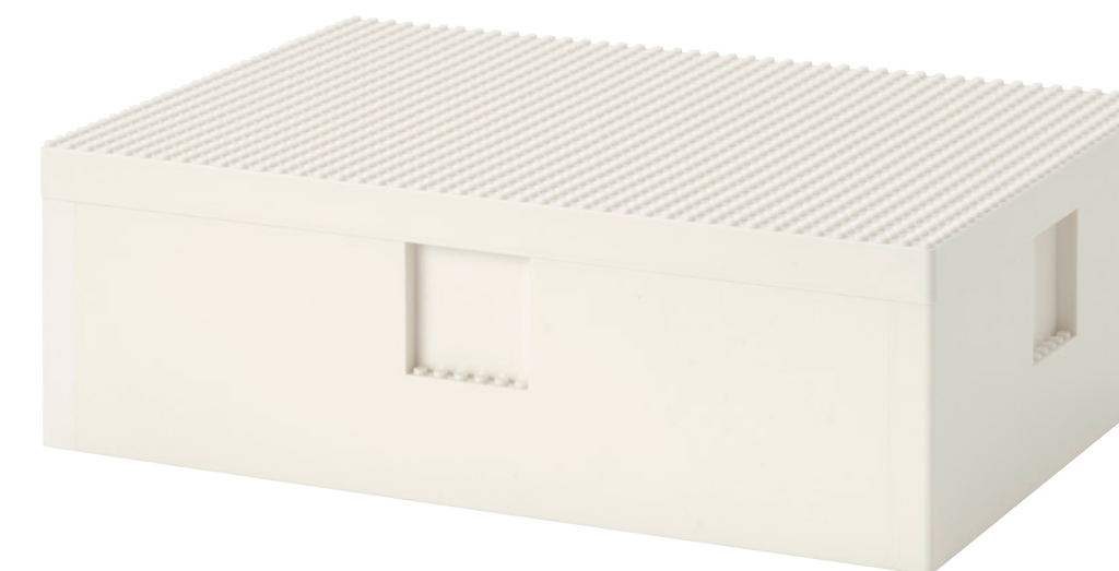
BYGGLEK box with lid €12.99. L26xW18, H12cm. White 503.721.87