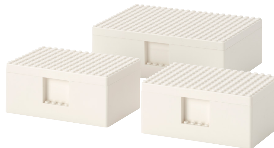
BYGGLEK box with lid, set of 3 €9.99. Comprises: 1 box (W175xD127, H59mm) and 2 boxes (W127xD88, H59mm). White 703.721.86