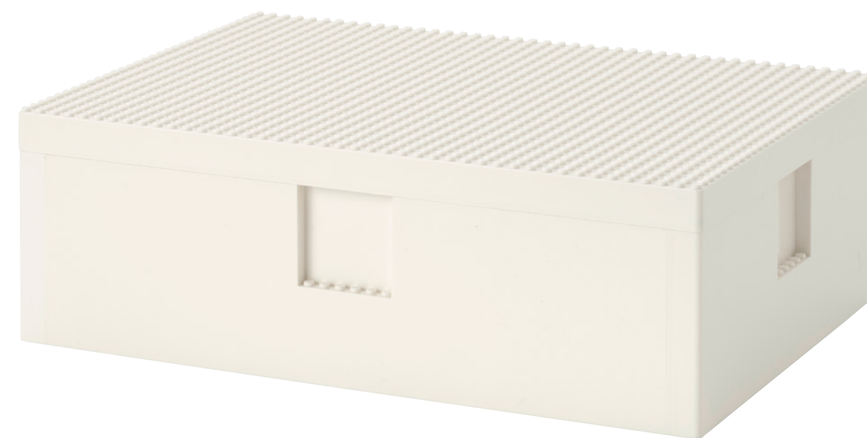
BYGGLEK box with lid €14.99. L35xW26, H12cm. White 103.542.08

There is also a BYGGLEK LEGO brick set, exclusive to IKEA stores, also sold separately.