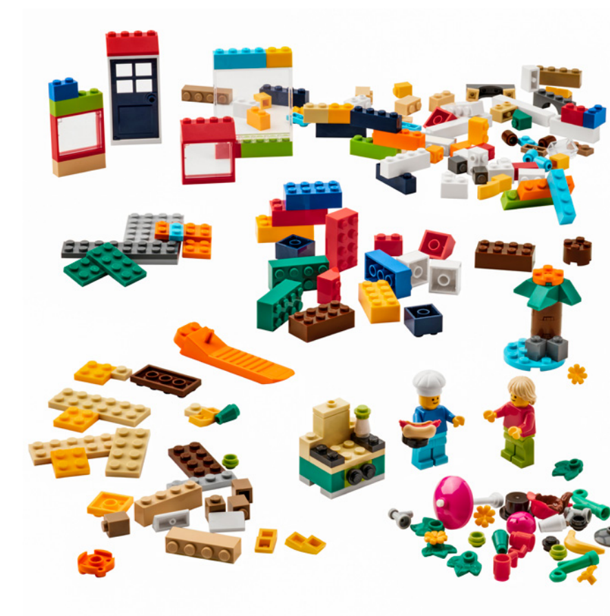
BYGGLEK 201-piece LEGO brick set €14.99 Comprises: 200 LEGO bricks in different colours, shapes and sizes plus 1 practical tool. Mixed colours 204.368.88