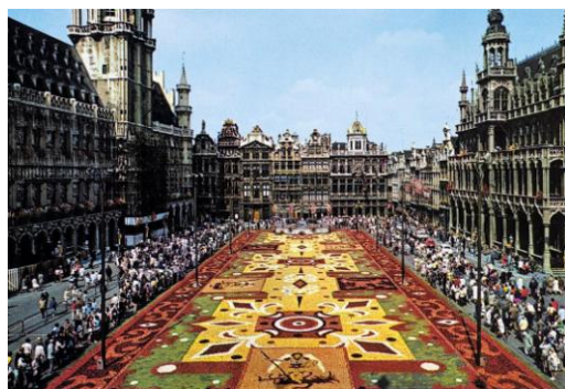
The first Flower Carpet in 1971

He very quickly realised that floral carpets would be an excellent vehicle for the promotion of his beloved begonias which he had always worked with, technically, economically and aesthetically. After years of attempts and calculations, this architect, who was inventive and imaginative, and knew how to make the most of the numerous resources of begonias, became an expert in the creation of superb floral carpets with sophisticated colours and complicated designs.