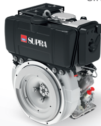
Most powerful single-cylinder diesel in the world