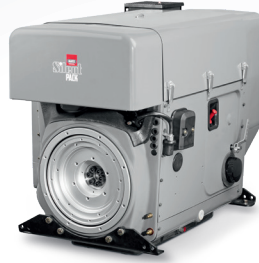
Silent Pack: 90% noise reduction