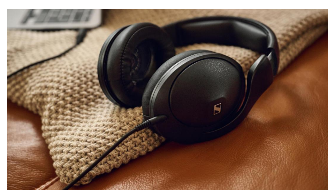
Pictured: The HD 620S is constructed of premium materials for lasting durability and comfort