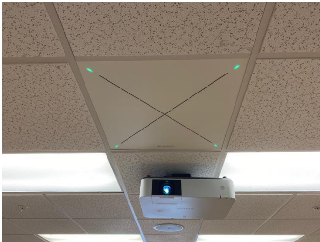
For USF, Sennheiser's TeamConnect Ceiling 2 presented a cost-effective option that featured excellent performance and was also easy to deploy