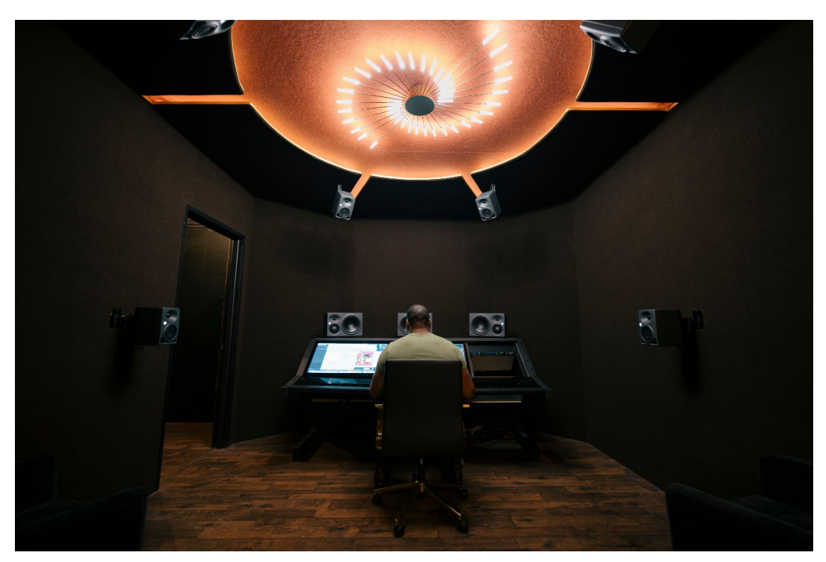
Walt mixes in the Solaris Room – the latest addition to Lounge Studios is certified for Dolby Atmos and features 12 Neumann KH series monitors to achieve "mind-blowing" immersive audio playback.

In keeping with Lounge Studios' ethos of accessible best-in-class audio, Walt and Blue are also making sure that their artists can take advantage of the latest and greatest audio production formats, including Dolby Atmos. Walt has recently built and opened the Solaris Room, a Dolby-certified studio outfitted with 12 Neumann KH series speakers. According to Walt, "the feedback from everyone who has listened to Atmos through Neumann has been mind-blowing."