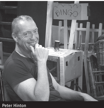
Rehearsal Photography by Peter Pokorny