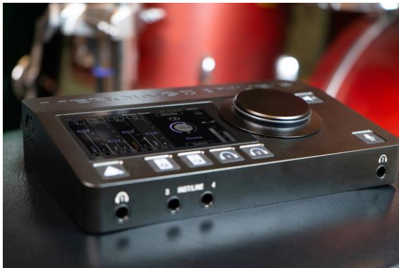
Merging Technologies will showcase its Venue Mission software and its personal mix for musicians

The second immersive workstation will showcase Merging Technologies audio interfaces. A highlight will be the company's Venue Mission software for the Anubis audio interface, which is set to revolutionise workflows for live musicians and sound engineers, providing them with unprecedented control over the entire audio ecosystem via an intuitive user interface that has a full 16-channel mixer at its heart.