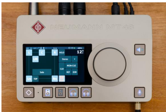
The Neumann MT 48 audio interface will receive a feature update, which will allow working in immersive audio formats

An insulated “Whisper Room” will accommodate selected Neumann microphones for demo. Moreover, Neumann will announce three new products. The MT 48 audio interface will receive an eagerly anticipated feature update, which, among other things, will allow working in immersive audio formats. Another focus is live sound: Neumann will show an omni capsule for the Miniature Clip Microphone (MCM) system as well as goosenecks of various lengths. Also on display will be much-requested additions to Neumann’s renowned family of vocalist capsule heads for wireless systems.