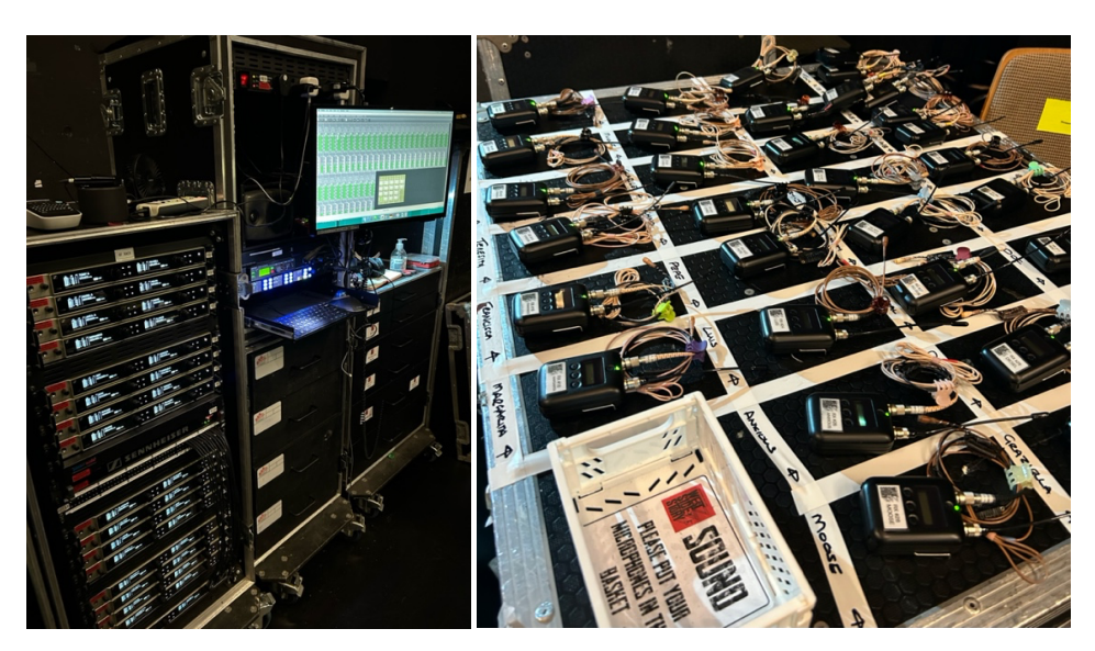
The show's audio equipment includes 14 Sennheiser EM 6000 dual-channel receivers and 34 Sennheiser SK 6212 mini-bodypack transmitters, among other Sennheiser and Neumann solutions