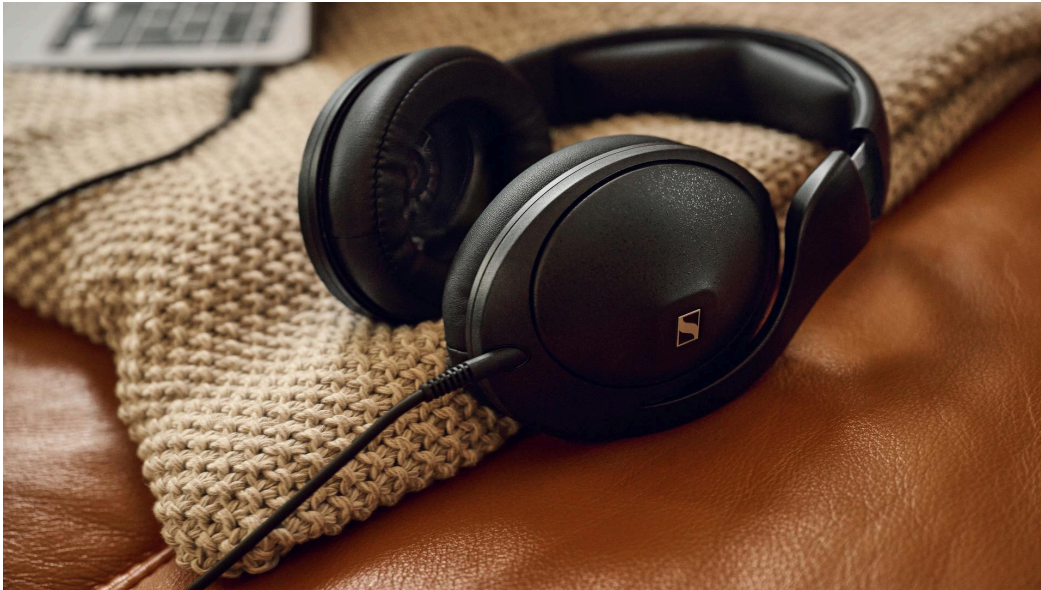
Pictured: The HD 620S is constructed of premium materials for lasting durability and comfort