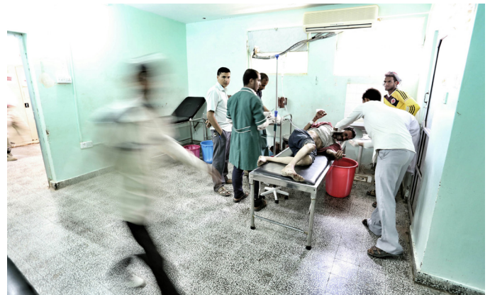
Yemen © Mohammed Sanabani