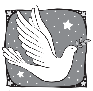
Peace on Earth ... pass it along during this