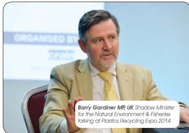
Barry Gardiner MP, UK Shadow Minister for the Natural Environment & Fisheries talking at Plastics Recycling Expo 2014

“To achieve the new recycling targets we must increase the plastics recycling capacity in the EU. The Plastics Recycling Show is a fantastic opportunity to demonstrate your knowledge and expertise in collection, sorting, grinding, washing, drying and extrusion to investors, waste management companies, brand owners, converters, entrepreneurs and recyclers. EU and national policy makers and many other stakeholders will also visit this unique trade show in the heart of Europe in order to better understand how plastics will contribute to the circular economy. If you believe in plastics recycling come and join us!”