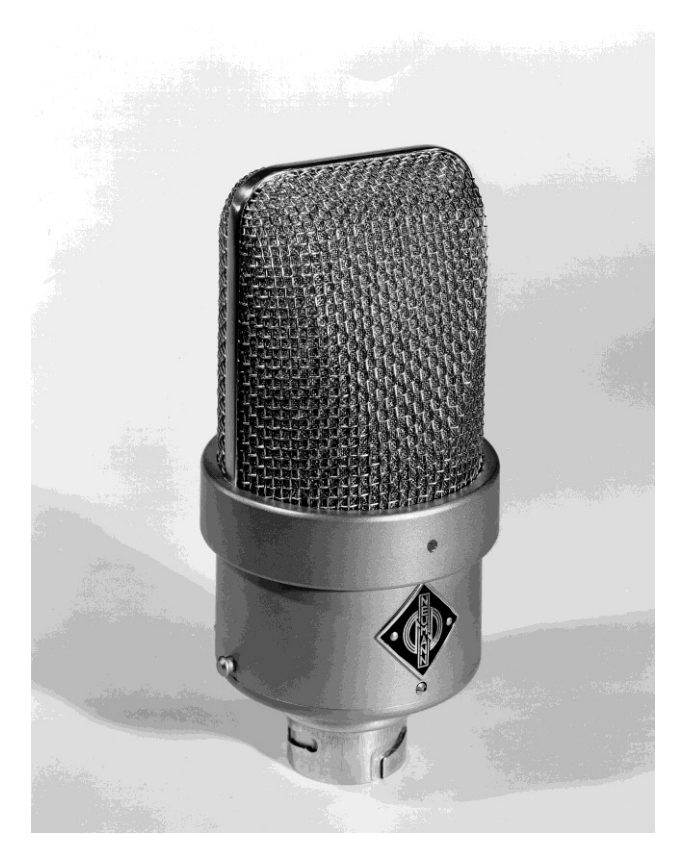
The M 49 joined the NAMM TECnology Hall of Fame in 2024, 73 years after its introduction.

Designed on contract for the IRT (the governmental regulating arm of the German broadcast system) the Neumann M 49 debuted in 1951 and was an instant success. Its sound can be heard on the classic recordings of the time, and it was known for its distinct sound character on nearly any source - particularly on female vocals.