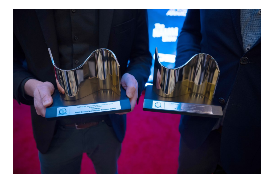
Neumann M 49 Inducted into NAMM's TECnology Hall of Fame, While Sennheiser and Neumann are Both Recognized at 39th Annual NAMM TEC Awards

Sennheiser's EW-DX Wireless Microphone System and M 49 V Tube Microphone Capture Outstanding Technical Achievement Awards