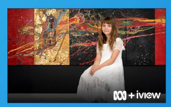
MAKING CHILD PRODIGIES Series Premiere Tuesday 29 May 8.00pm

Brand New Series Starts Tuesday 29 May 8.30pm