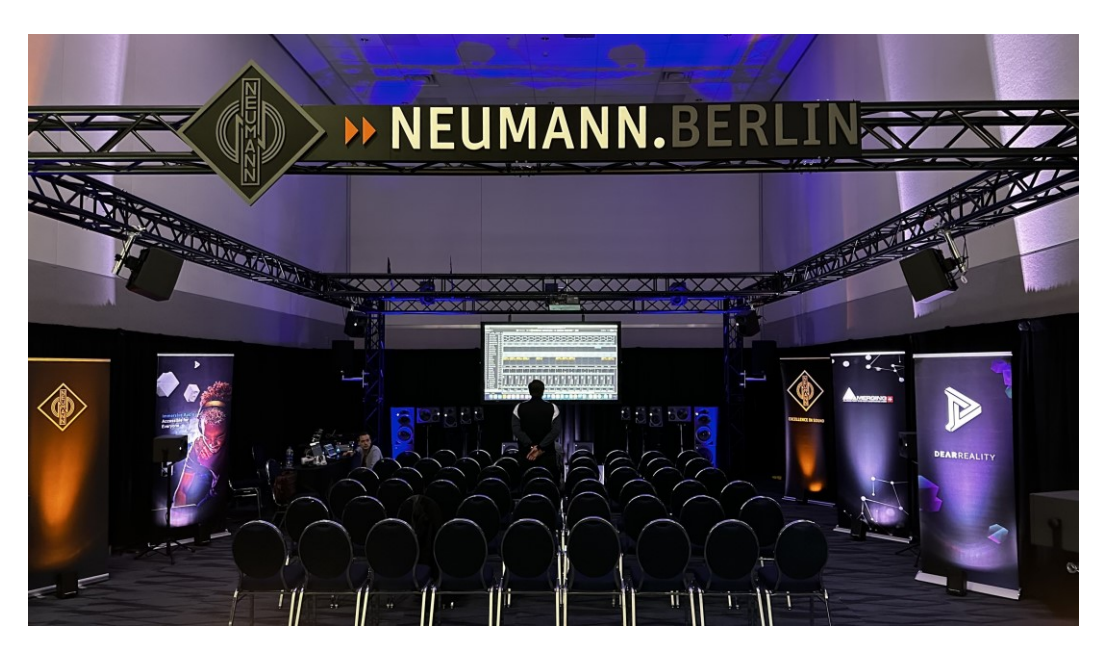
Sennheiser Group brings innovative immersive audio solutions and expert insights to AES NY 2023

Neumann hosts immersive audio panels and presentations featuring Grammy Awardwinning engineers throughout the show at Demo Room 3D03