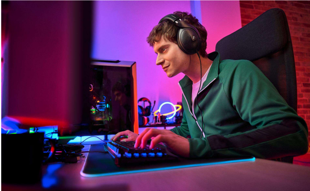
Pictured: The immersive, hyper-detailed presentation of the HD 620S is ideal for audiophiles and gamers alike