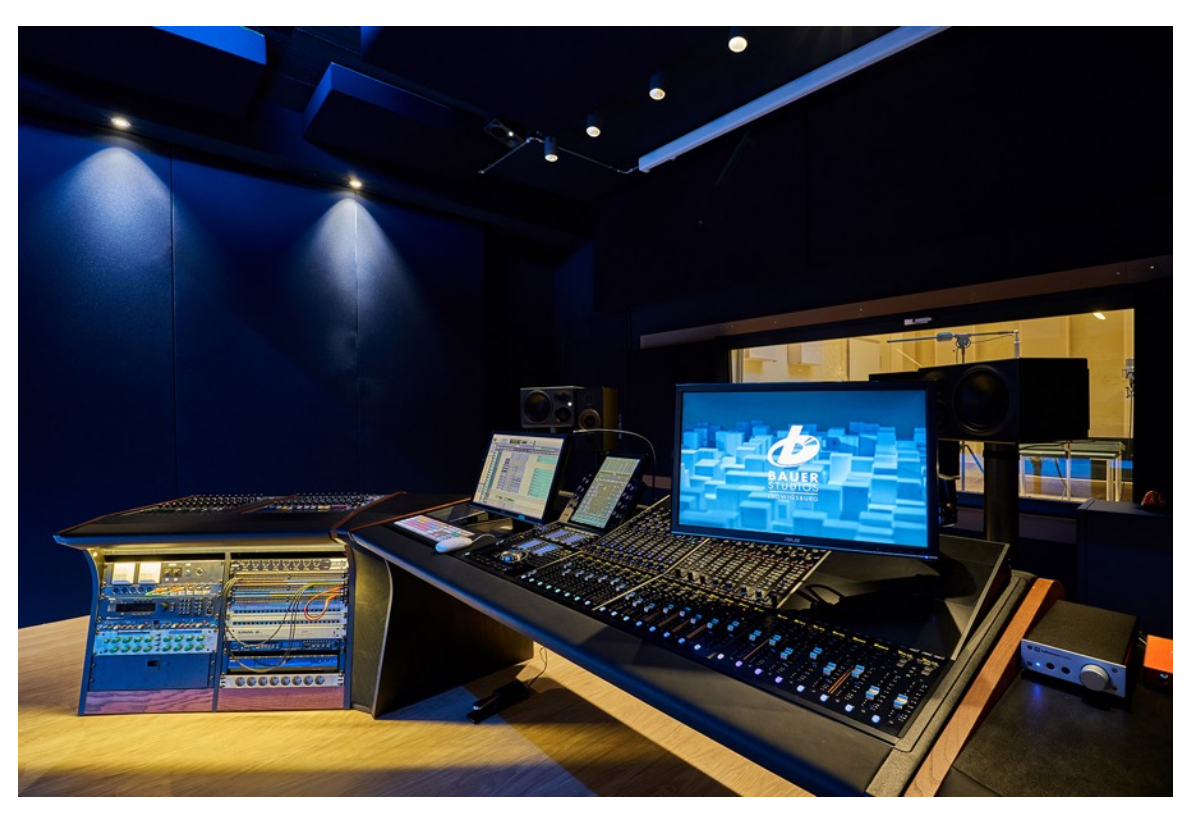
The redesigned Studio 2 is equipped with an Avid S6 console, which also serves as the monitor controller for the 5.1.4 or 7.1.4 setup.

The newly designed Studio 2, optimized by Markus Bertram (MB Akustik), was therefore to be equipped with a monitoring system that supports common surround formats as well as Dolby Atmos. When it came to choosing the loudspeakers, Neumann studio monitors were quickly selected as the first choice.