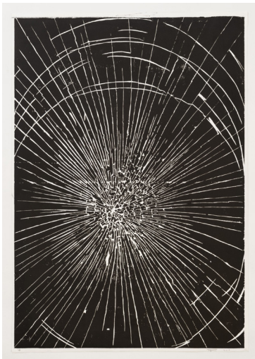
Thomas J Price, 'Shattered Times (Camden, Point of Contact #1),' 2019