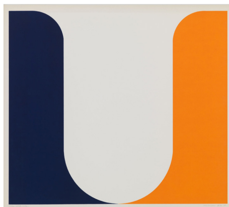
Takesada Matsutani, 'White Sake,' 1970