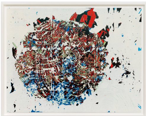
Mark Bradford, 'Rona,' 2023

Hauser & Wirth brings four special charitable editions to LOPF 2024. These include benefit prints by Bharti Kher , the proceeds of which will support her forthcoming solo exhibition at Yorkshire Sculpture