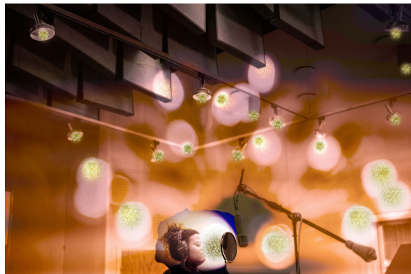
Sonia Boyce, 'Sofia,' 2021