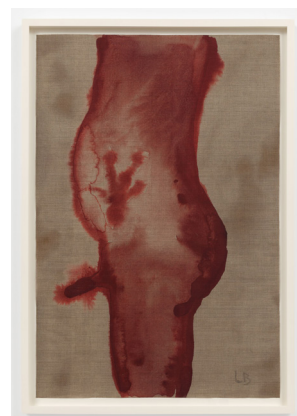
Louise Bourgeois, 'The Maternal Man,' 2008