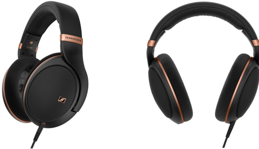
Pictured: The HD 505 is a compelling option to get into audiophile listening