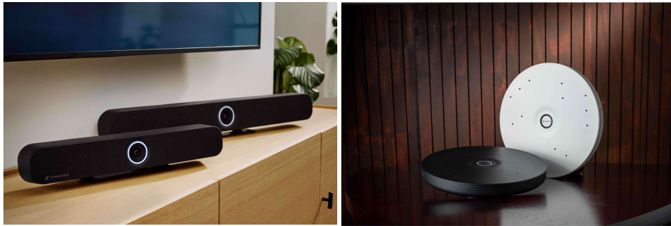
Sennheiser's TeamConnect Family solutions

Visitors will also have the opportunity to get hands-on with Sennheiser's cutting-edge wireless solutions, featuring EW-DX , the latest addition to the Evolution Wireless Digital Family, and a live demo of MobileConnect , the bidirectional solution to hear clearly, respond effortlessly and interact live.