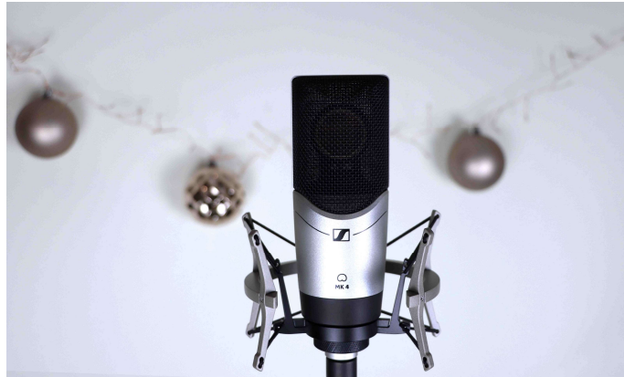
MK 4 pictured with optional MKS 4 shock-mount

With the typical warm sound of a studio condenser mic, the MK 4 is a great all-rounder for podcasting and voice-overs, as well as for recording vocals and instruments. It delivers fantastic sound quality, while still being an affordable choice for home recording.