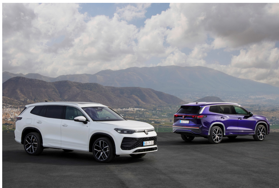
The new Tayron in Oryx White pearl effect and Ultra Violet metallic.