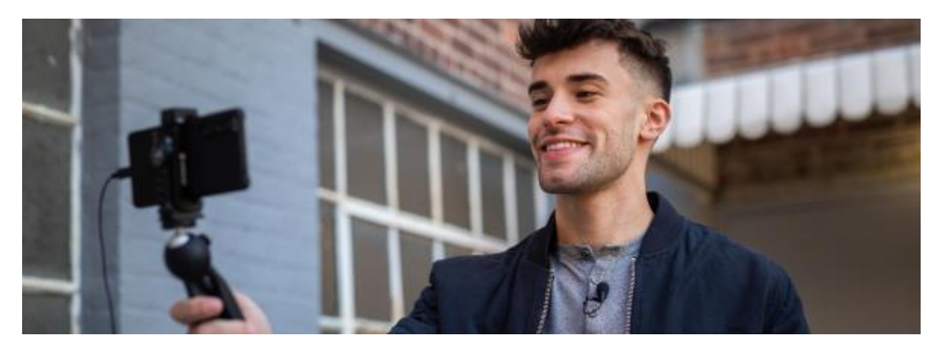
Simple and effective audio solution for vloggers and podcasters

Sennheiser XS Lav mics for content creation