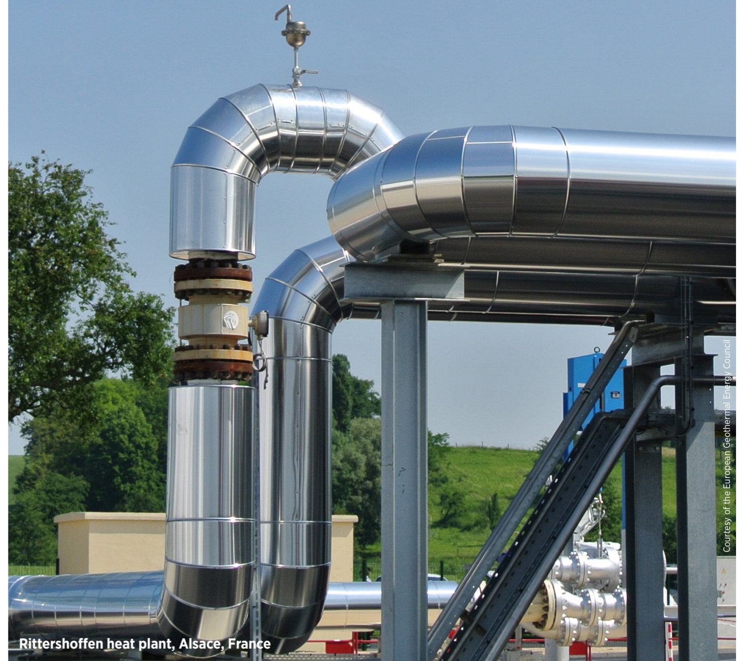
Rittershoffen heat plant, Alsace, France

The Alliance is an inclusive and neutral multi-stakeholder platform that brings together public, private, intergovernmental and non-governmental actors. They share a common vision of accelerating the deployment of geothermal energy for power generation and other applications