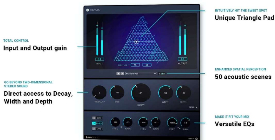
The EXOVERB user interface