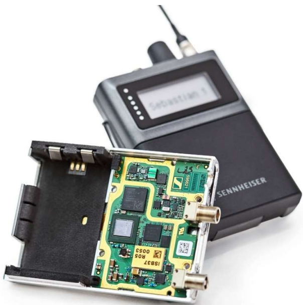
Sennheiser Spectera beltpack with Analog Devices ADRV9003 chip

Last but not least, the RF configurability and agility of the ADRV9003 enables Sennheiser to future-proof its ecosystem, as the chip is capable of handling new RF bands that may become available in the future.