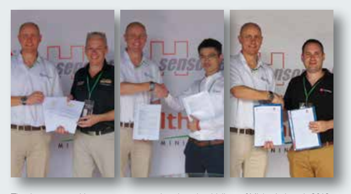
The three partnership agreements were signed on the sidelines of Mining Indonesia 2019.

"We are very excited to welcome these four new principals to our family and to offer their high-quality solutions to our customers. By working in partnership with our principals and customers, we are confident of growing with South East Asia."