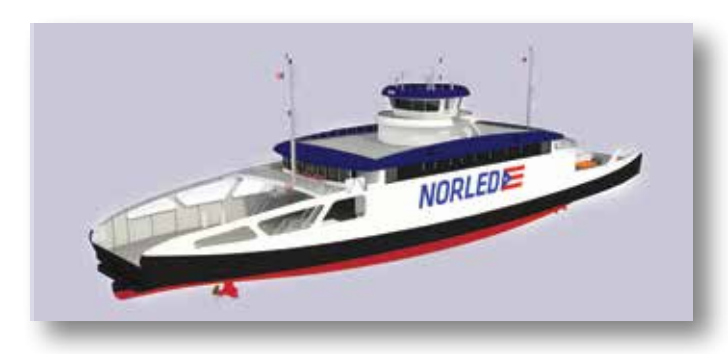
Artist's impression of Norled hybrid plug-in RoPax / Image Courtesy of Sembcorp Marine.

Jul 2019 Cables International has been working closely with customers such as Sembcorp Marine Integrated to grow our presence in the renewable energy sector. In July, Sembcorp Marine Integrated awarded us with a contract to supply two topsides for Ørsted Wind Power as part of the UK's Hornsea 2 Offshore Wind Farm project. The 1.4-gigawatt capacity wind farm will be the world's biggest when it becomes operational in 2022. Just a few months later, in November, we were awarded another contract to supply three roll-on/roll-off, plug-in ropax ferries for Norway's Norled AS project. These highly energy-efficient vessels will operate normally on zero-emissions battery power. When required, they can run on combined battery-diesel hybrid backup modes. These projects add to our track record in the North Sea, which includes the Culzean CPP WHP ULQ platforms, Kraken FPSO, and Catcher FPSO.