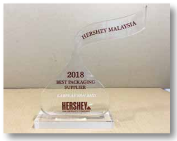
We are proud to be recognised as the 'Best Packaging Supplier of the Year 2018' by the Hershey Company.

Over in Indonesia, JJ-Lapp has successfully recertified our flagship product, the ÖLFLEX CLASSIC II0 and H05V-K and H07V-K, by passing the Germany-based VDE Institute's stringent testing on our first attempt.