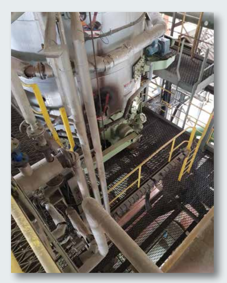
JJ-Lurgi's latest project wins include the upgrading of a Lurgi solvent extraction plant for PGEO that has been in operation since 1977.