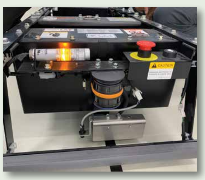
The tailored AGV solution for Sony.

As Sony's AGV system uses magnetic tape on the floor as a guiding line, we proposed to replace this with a sensor-based solution using luminescent tape. The luminescent tape coating is invisible to the human eye but can be tracked by a particular SICK sensor type.