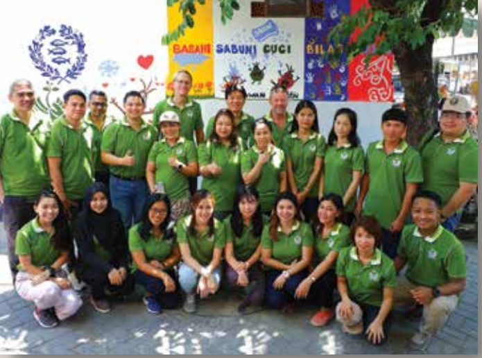
Our green heroes from the Meet a Green Need trip to Kui Buri, Thailand.