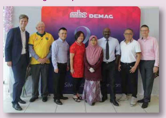
Celebration held on Sep 26, 2019