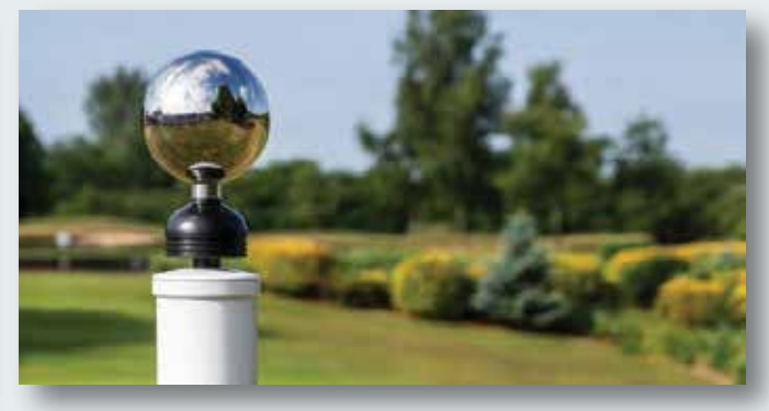
Biral – one of four major brands to join the Jebsen & Jessen Technology family of principals.