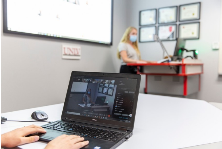
TeamConnect Ceiling 2's Dante compatibility makes it easy to control, monitor, add or remove devices on the network.