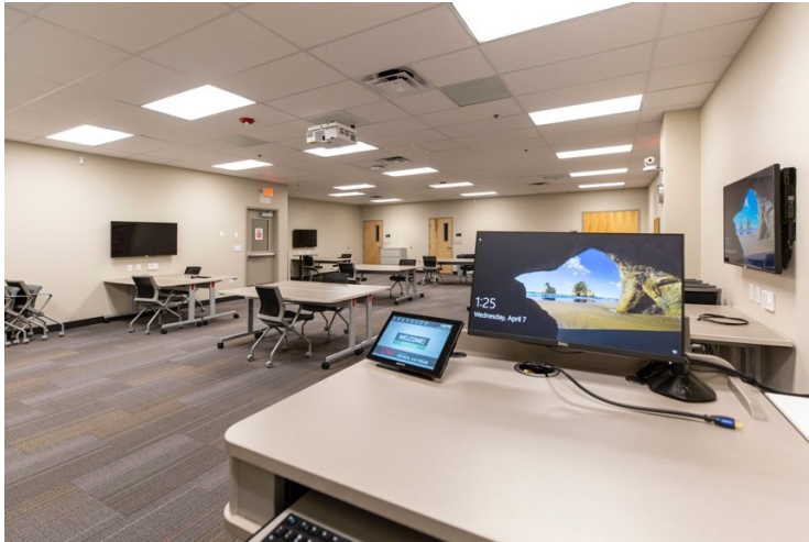
University of Nevada, Las Vegas, has rolled out 58 multi-purpose classrooms — each including Sennheiser’s TeamConnect Ceiling 2 microphone solution

One specific requirement from the administration was that each room had to be a technical ‘carbon copy’ of the other. “While the rooms might be different sizes and contain different furniture, it was important for us to deliver similar functionality in each room,” Alaimo says. “One thing we wanted to guarantee for our instructors was that when they go from one building to another, the touch panel would be exactly the same and they will be able to record lectures while experiencing top-quality A/V conferencing.”