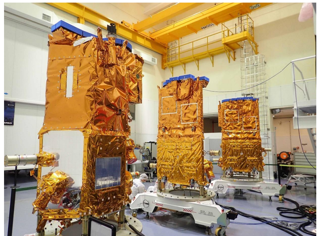
CERES satellites